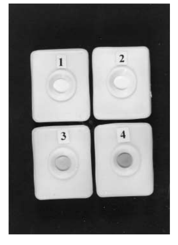
Figure 2. Rapid and simple detection of the HCV-NS4 antigen in serum samples of HCV infected and noninfected individuals using dot-ELISA. The devices labeled 1 and 2 represent serum samples from noninfected individuals (showing no antigen detection) and the devices labeled 3 and 4 represent serum samples from HCV infected individuals (showing weak and strong positive antigen detection, respectively).

dot-ELISA could detect the target HCV-NS4 antigen in 8 out of the 10 sera negative anti-HCV Abs but positive for HCV-RNA.